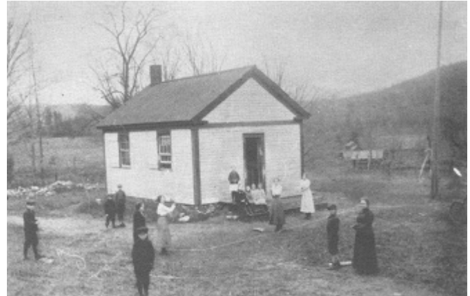
Stony Creek District 3 School (Wait District) 1915